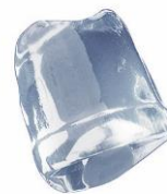
36 gr FULL ICE CUBE